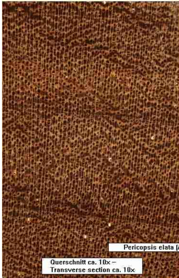
Pericopsis elata (Afromosia, Kokrodua)

Querschnitt ca. 10x – Transverse section ca. 10x